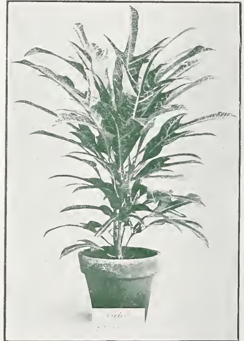
CROTON NORWOOD BEAUTY